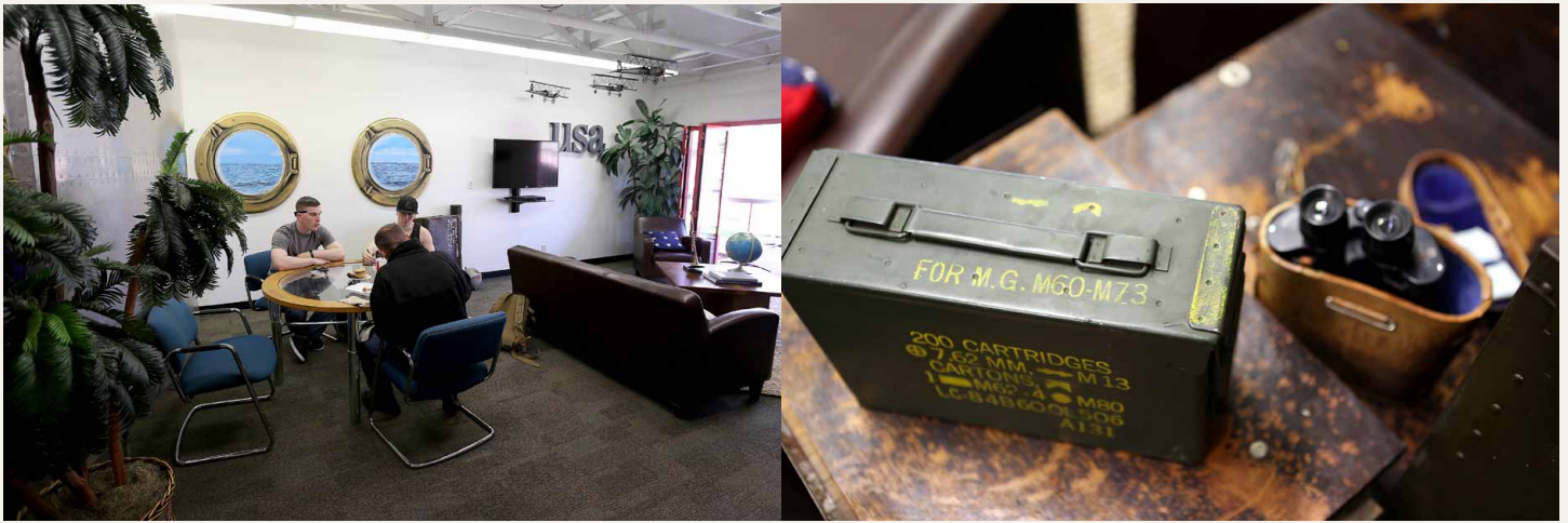
The interior of GCU's new campus Veterans Center includes military antiques that make the space feel more comfortable for vets and their families.