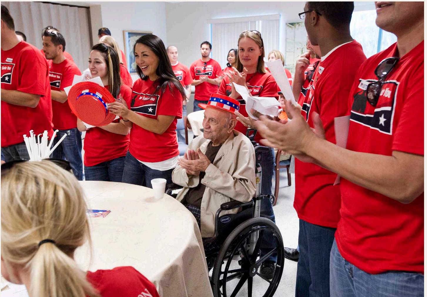
GCU's Military Division staffers visit the Arizona Veterans Home to honor veterans during Memorial Day events. The division includes dozens of veterans who understand military service first-hand, while other counselors have experienced seeing loved ones deploy overseas.