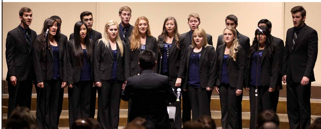
The New Life Singers performed four songs during the annual Opera and Broadway Concert by GCU's Music Department in February at First Southern Baptist Church.